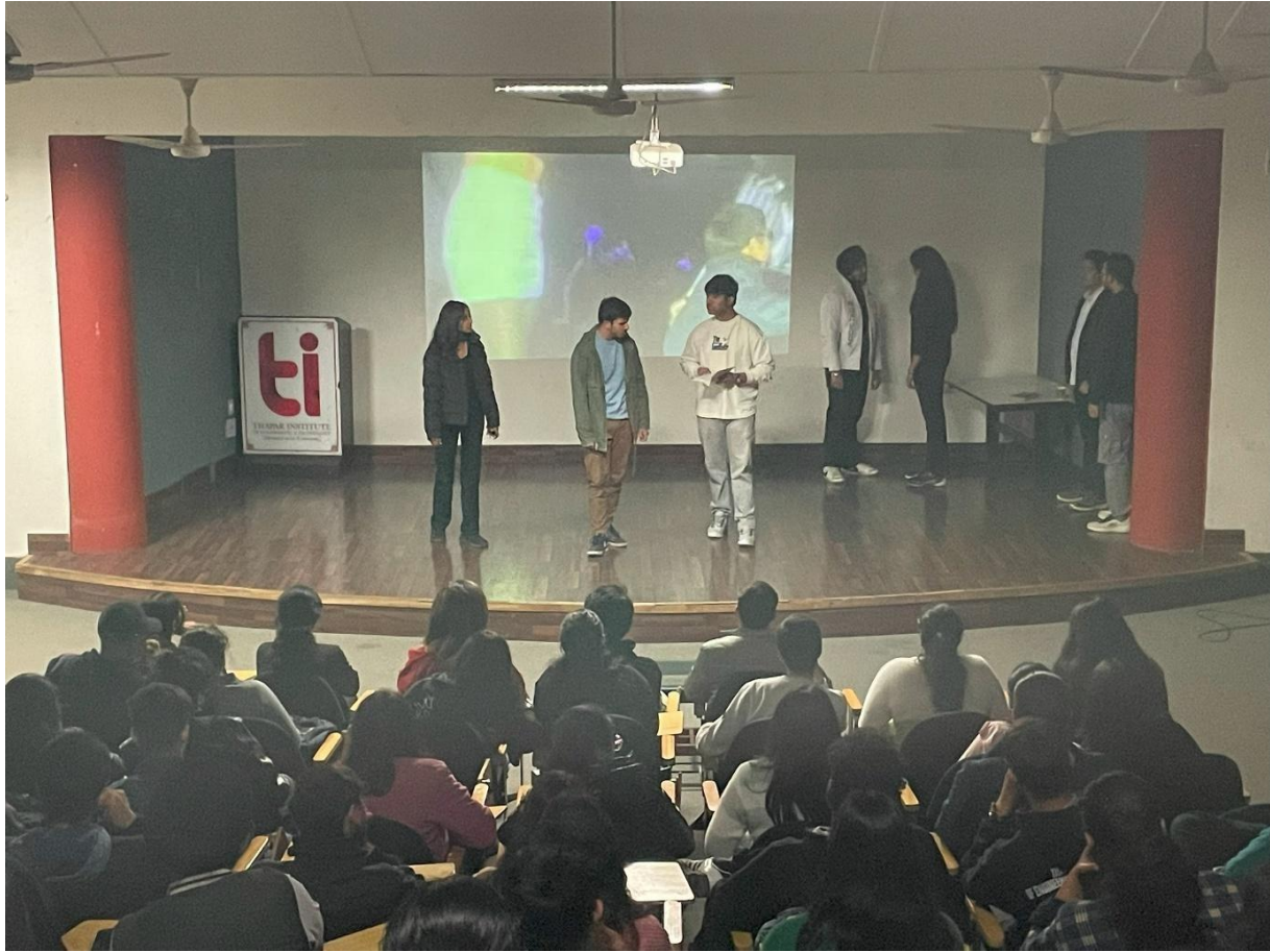
MHSAs performing a skit regarding peer pressure