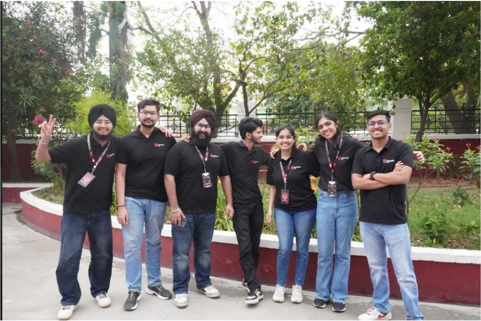
TICC's Executive Board Members