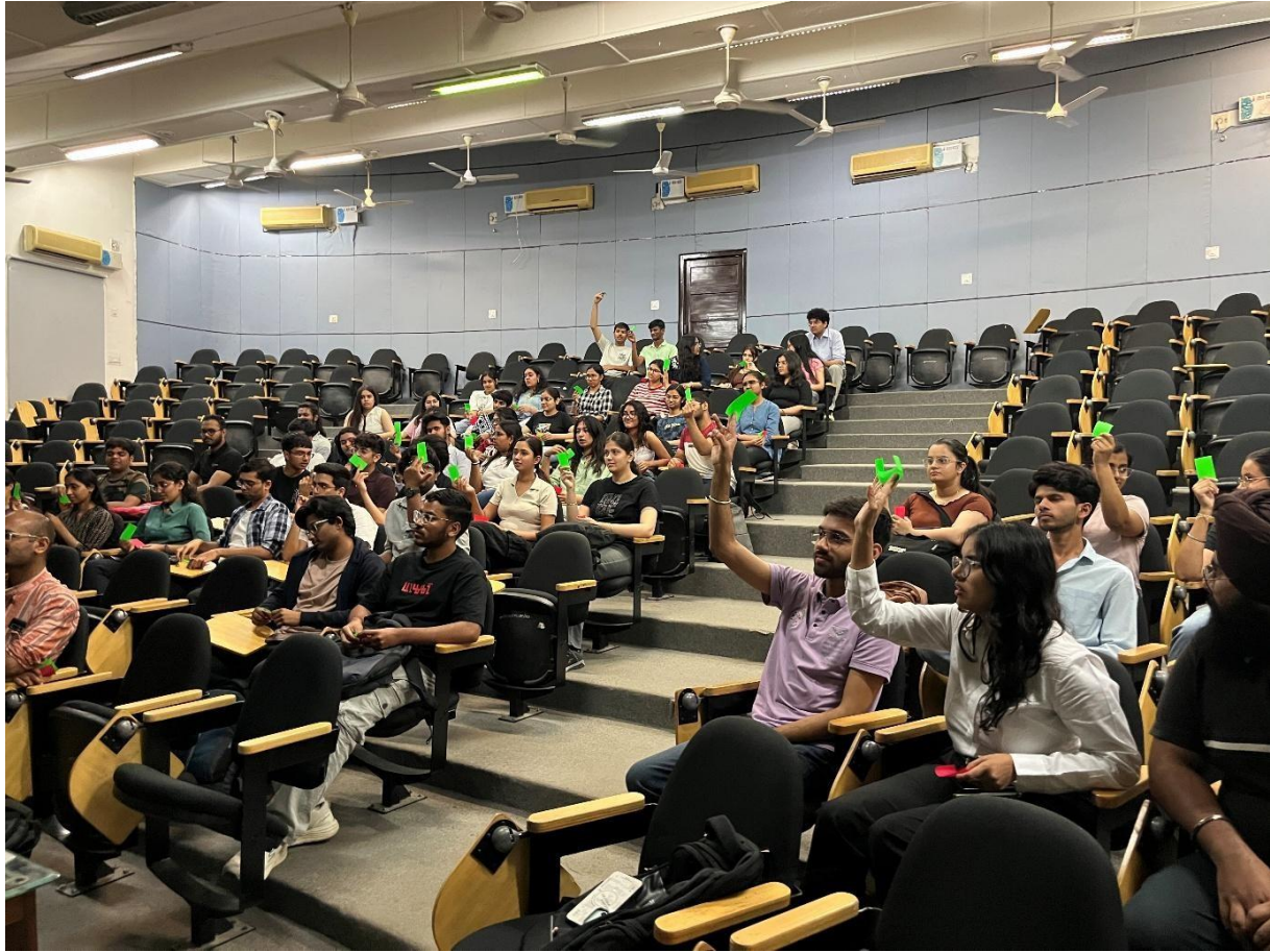
MHSAs concluding a myth vs fact game with the participants