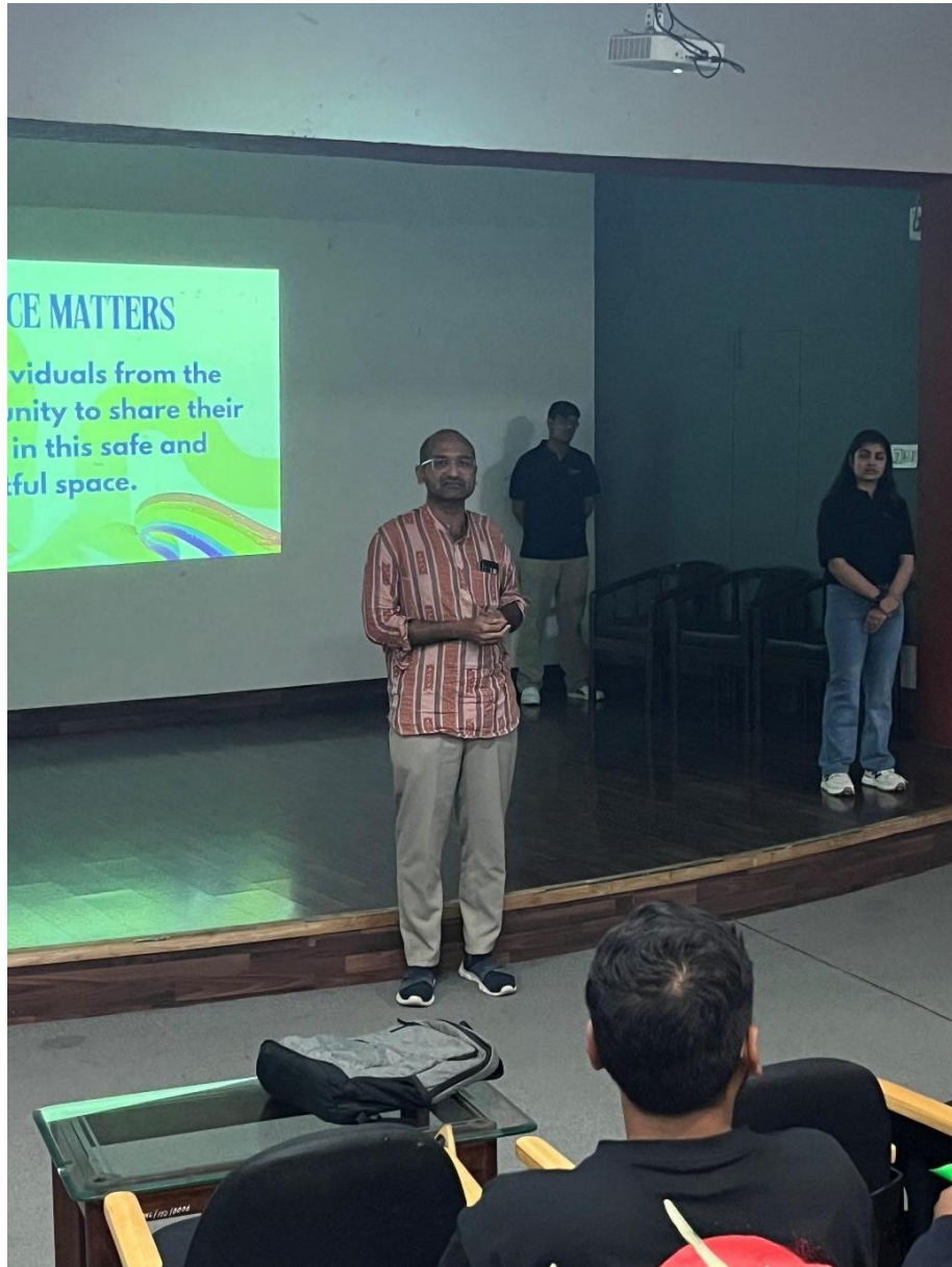
MHSA is conducting a activity your voice matters