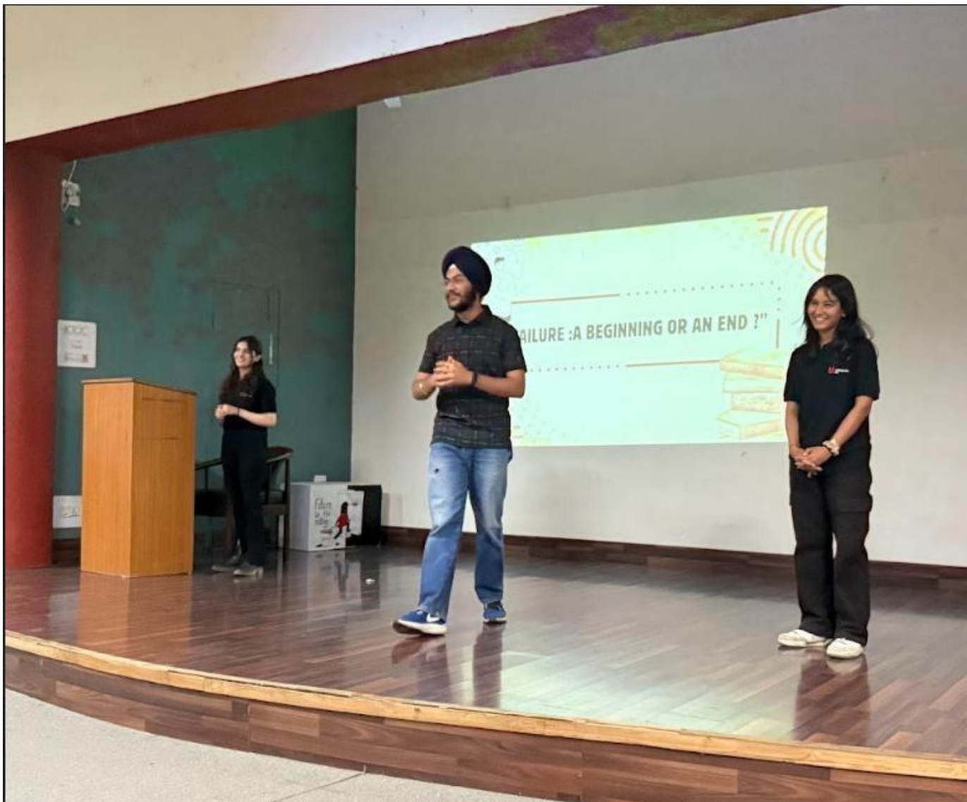
The Let's Talk Team conducting the session

The media taken during the event is attached below: