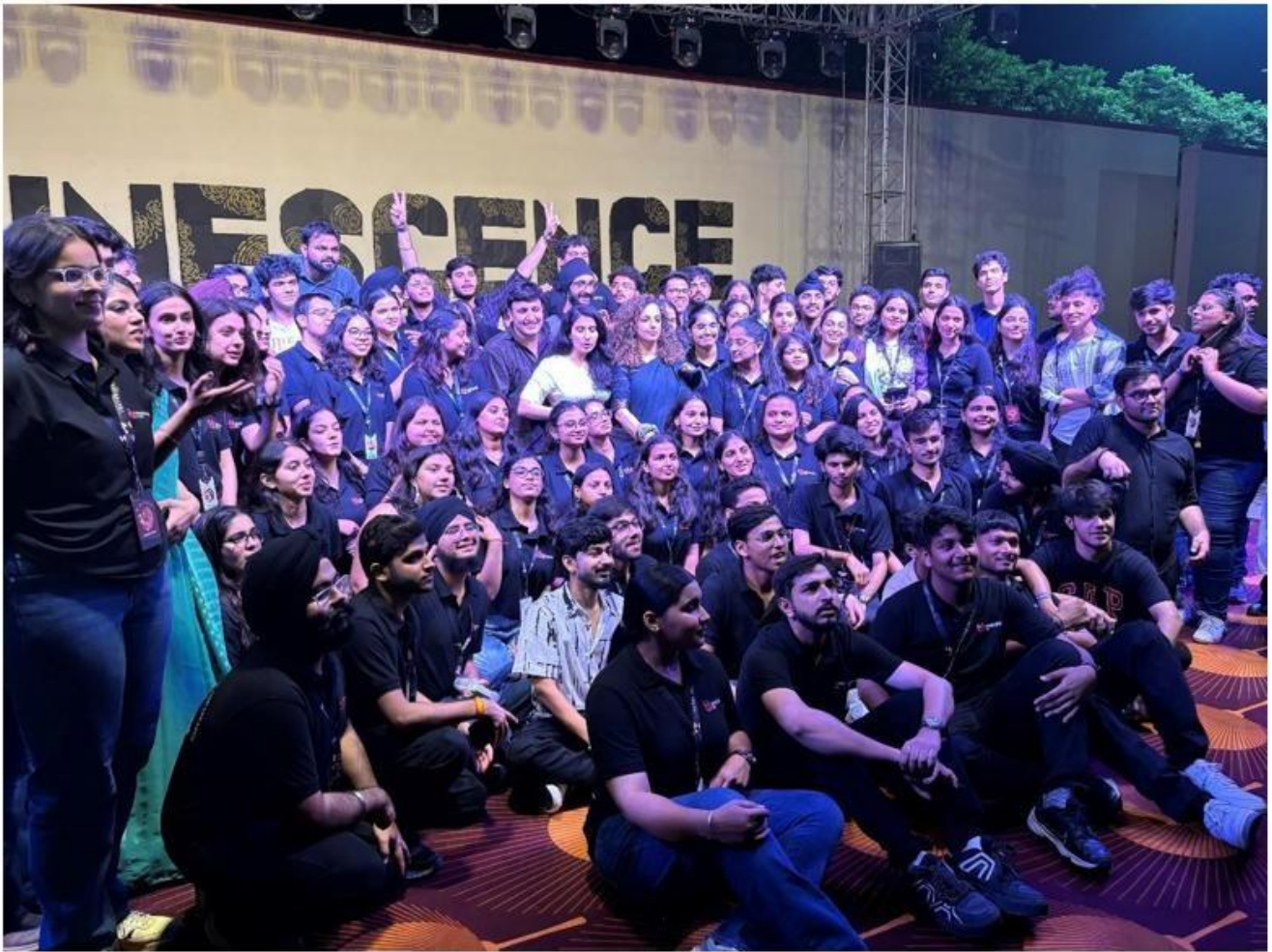
The organizing team for Muskurao by Luminescence

The media taken during the event is attached below: