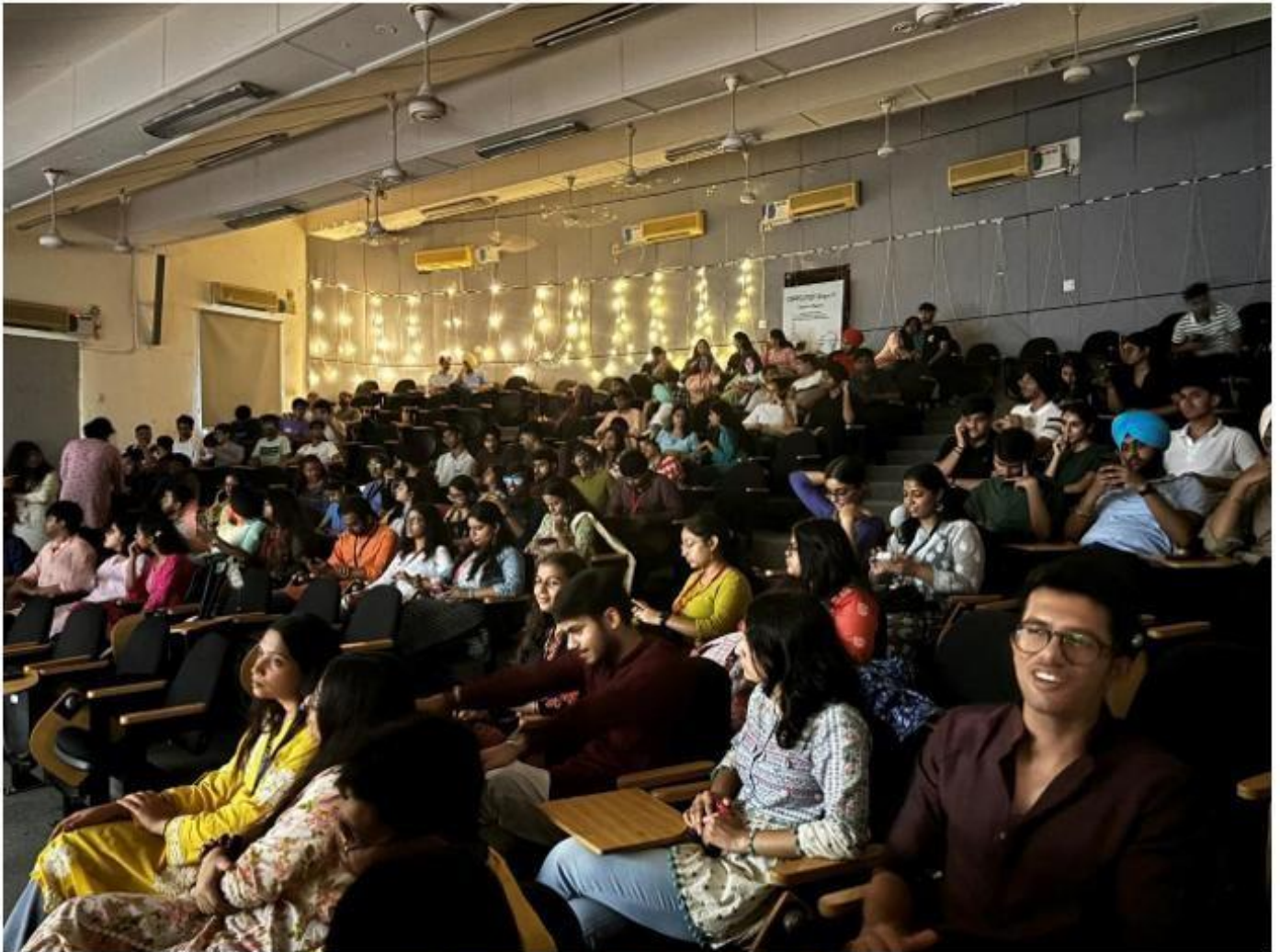
Audience in C-Hall for event Khayal

The media taken during the event is attached below: