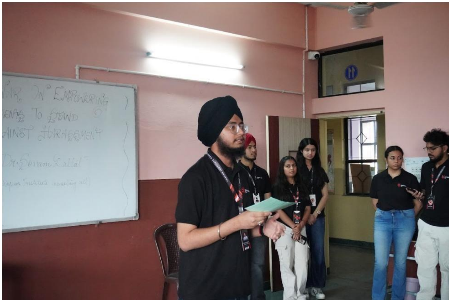
TICC team conducting a session