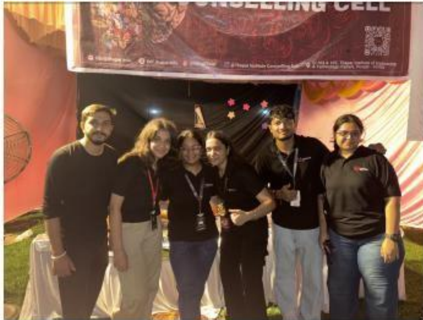
TICC Team which was present at TICC's stall at Society Fair

The media taken during the event is attached below: