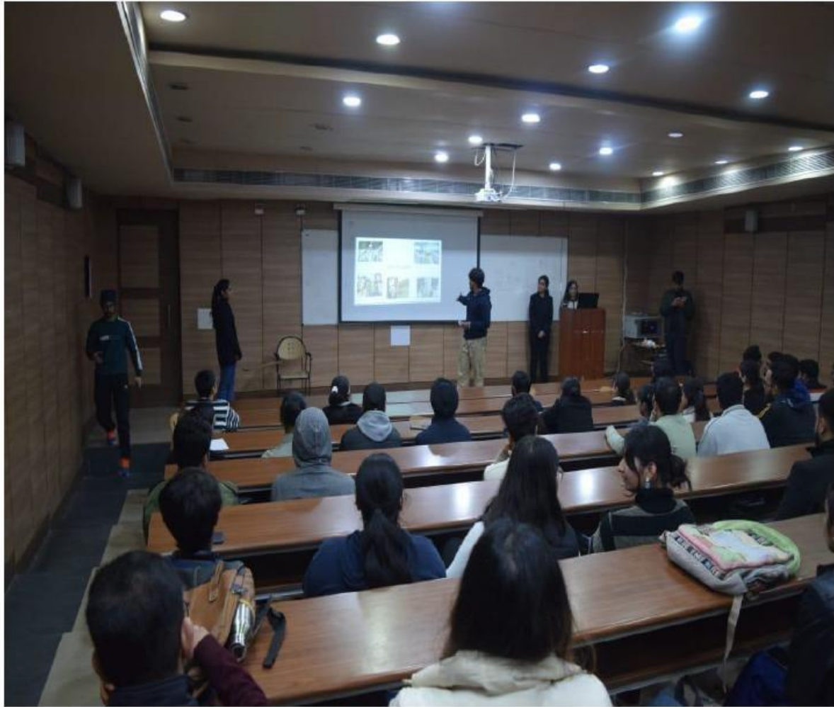
MHSAs are conducting an activity depicting the difference between Fake and Real photographs