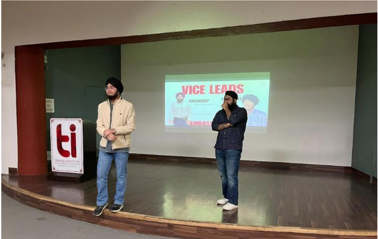
An ending note being delivered by the Vice-lead Ambassadors