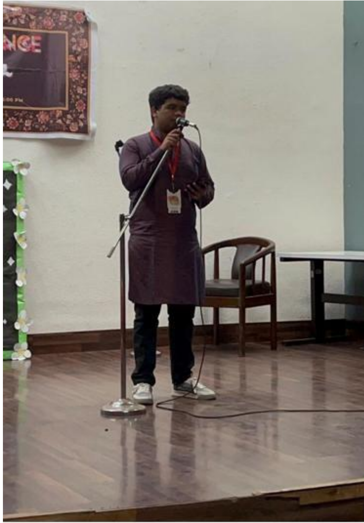
A performance showcased during Khayaal