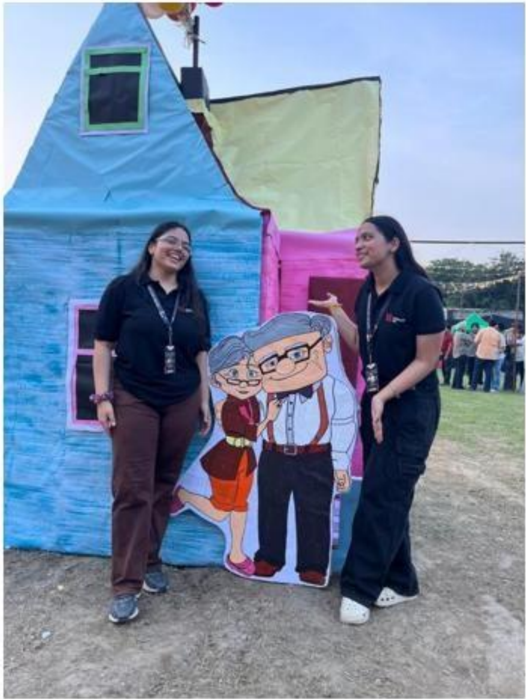
Calmfest's centerpiece at display