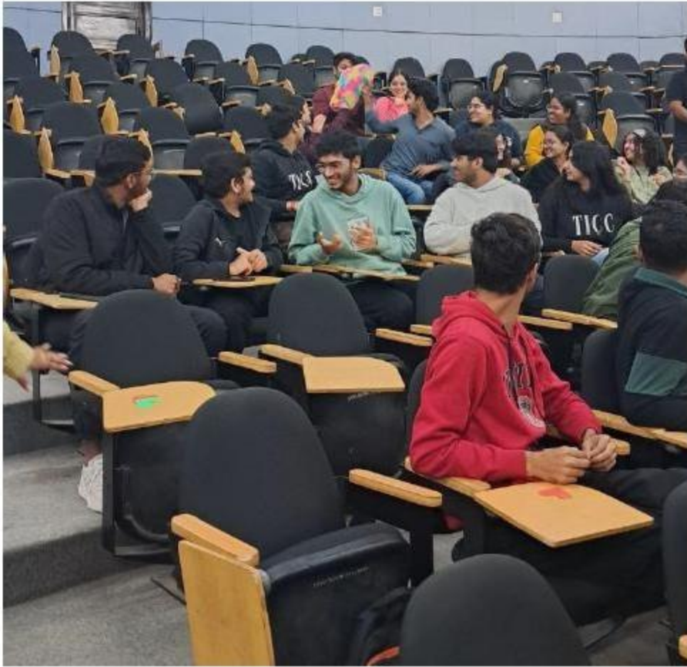
MHSA engages the participants, and builds a safe place for them to open up