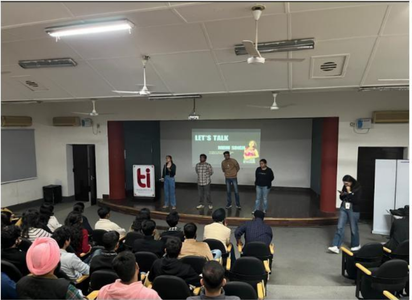
A department briefing being given by Let's Talk Department