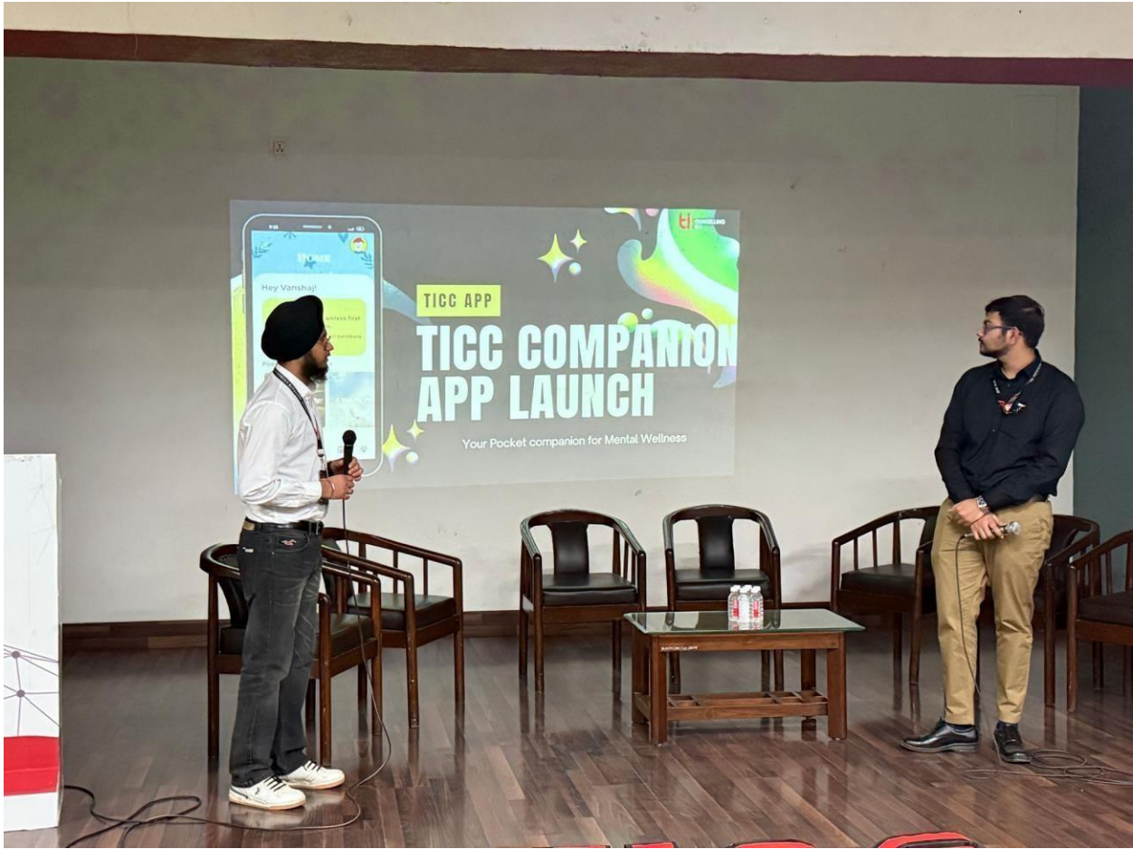
TICC Companion App Launch presentation