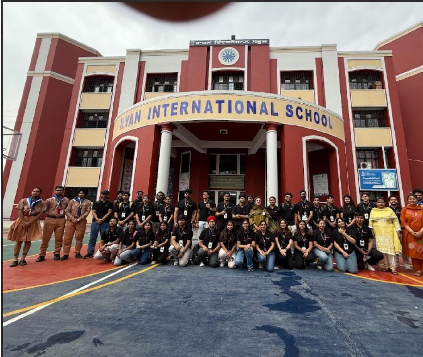
TICC team at Ryan International School

The media taken during the event is attached below: