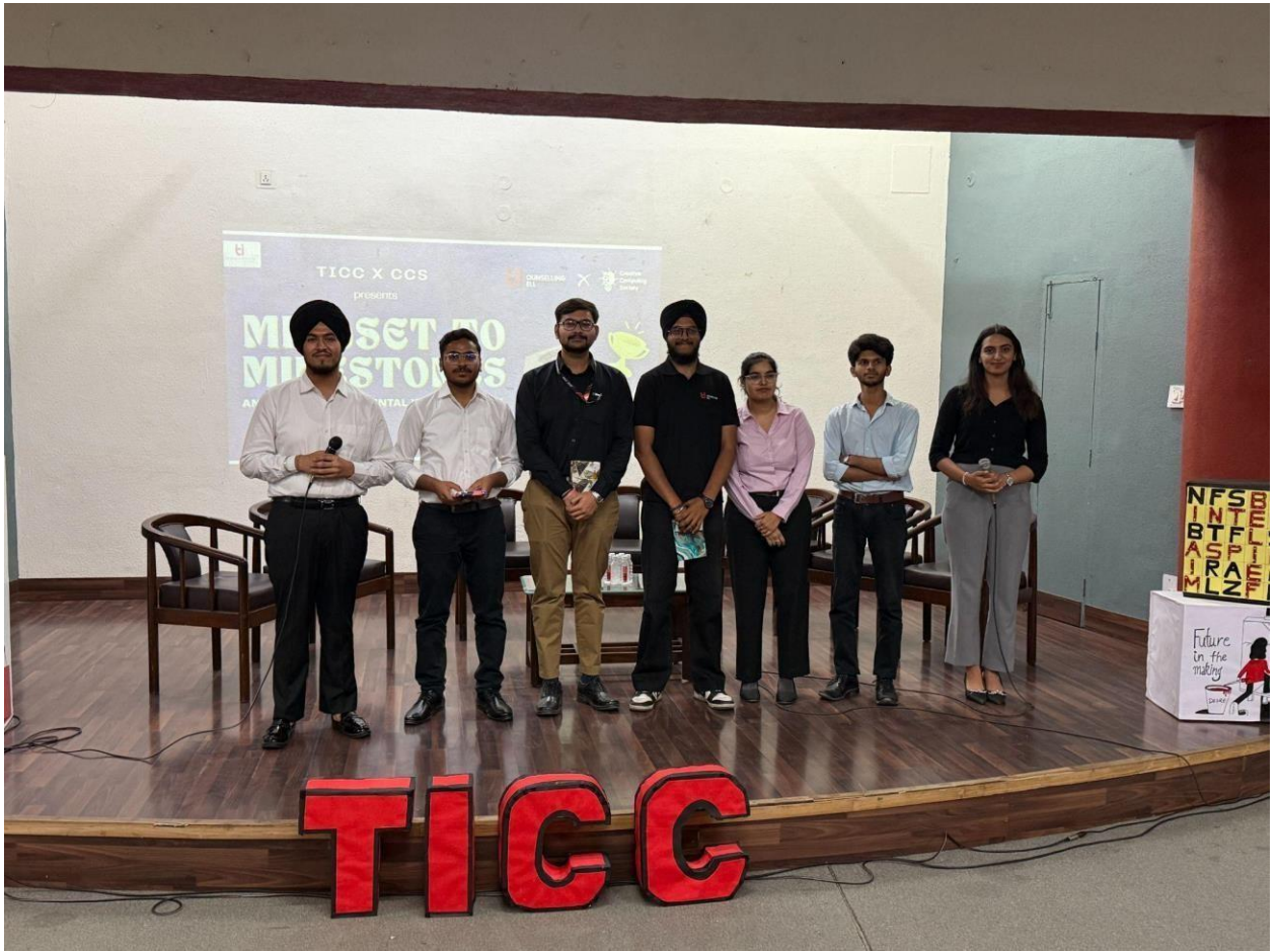
Winners of the quiz game receiving their awards