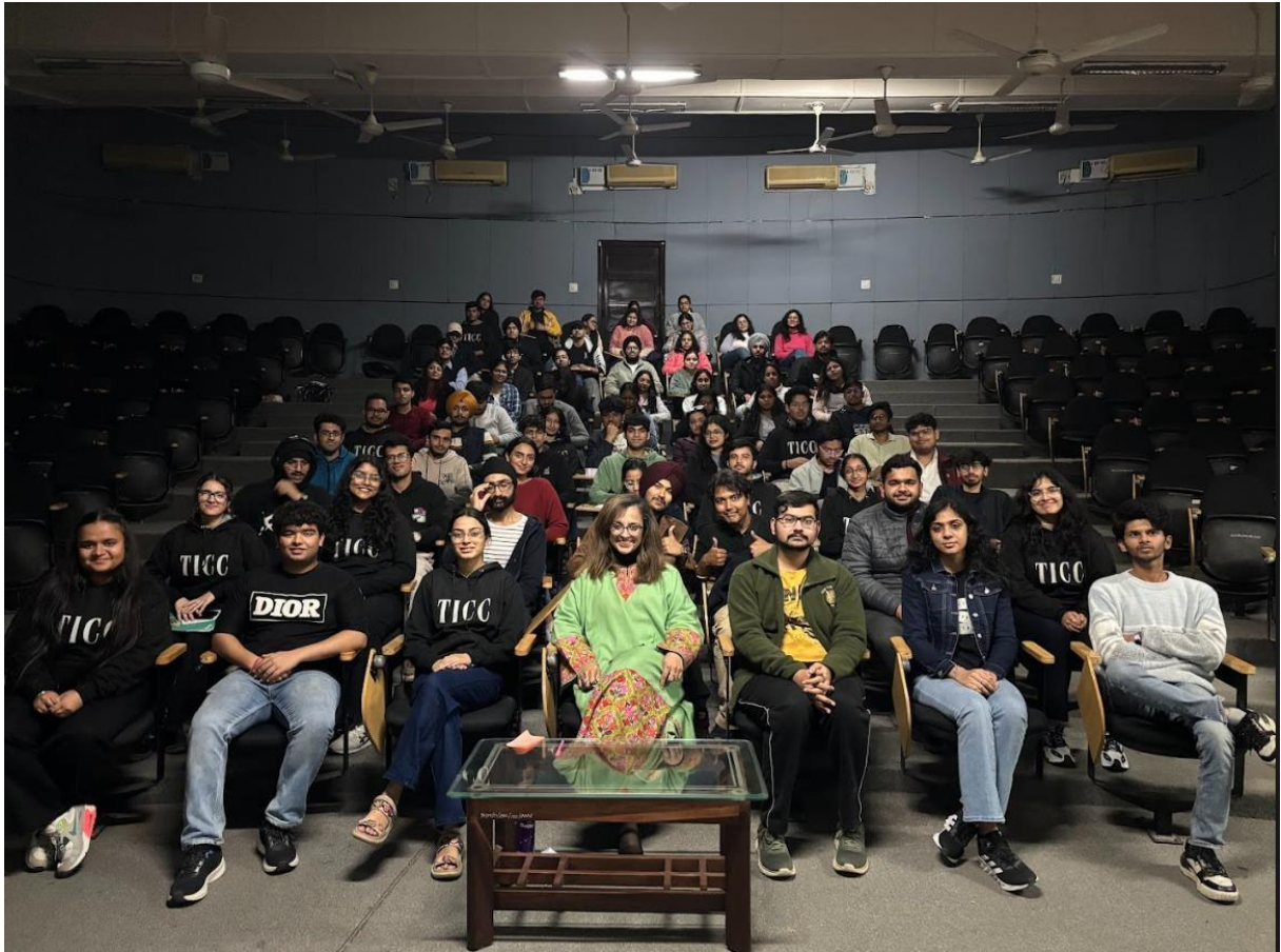
Attendees of the Let's Talk Session