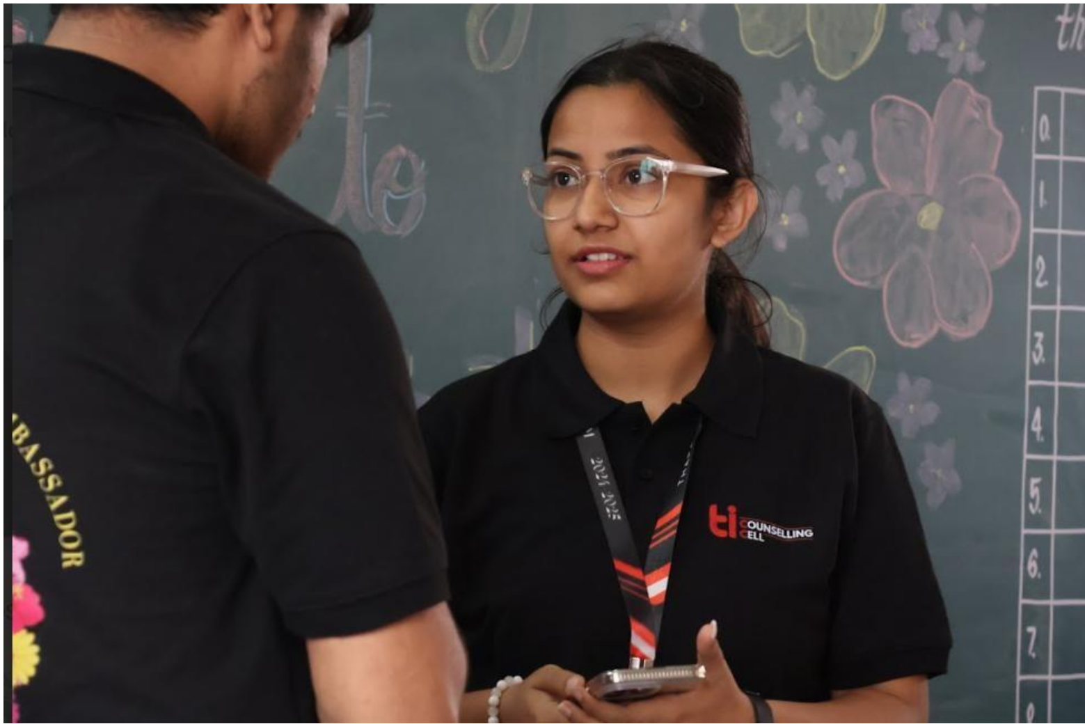
TICC team conducting a session