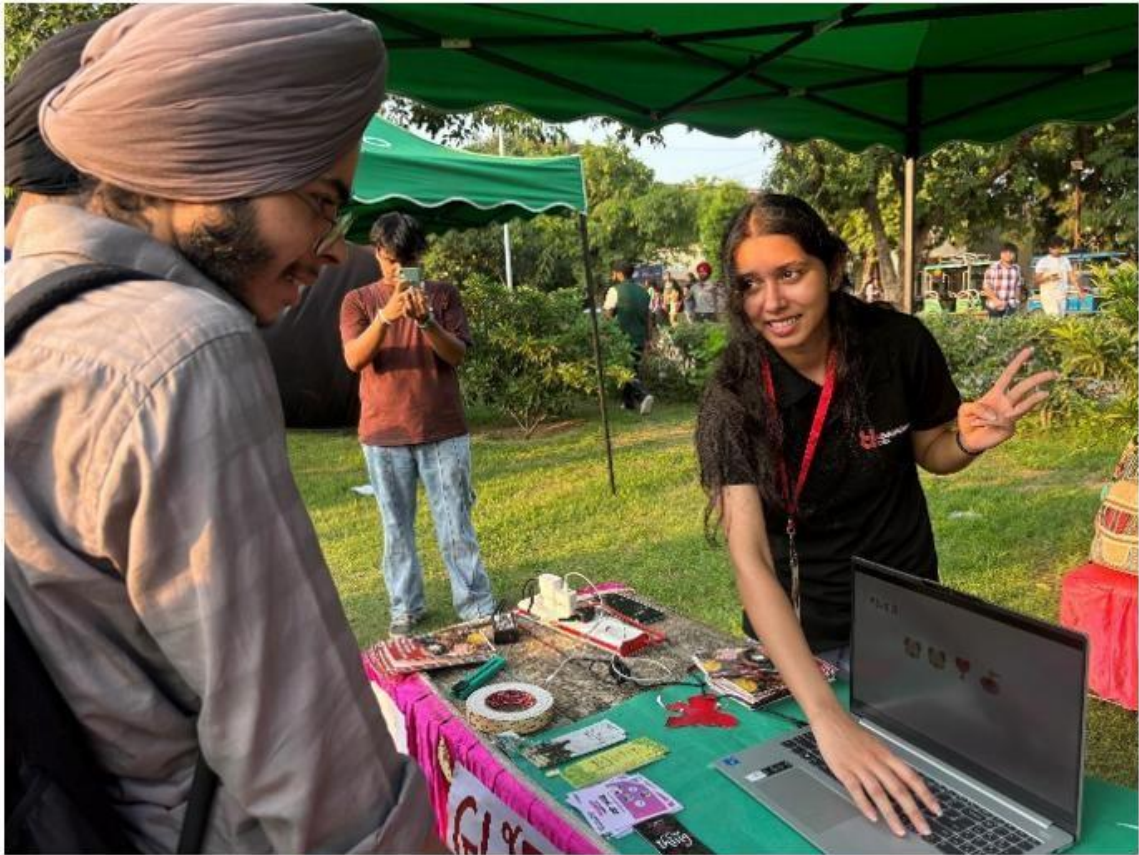
Audience members interacting in one of TICC's recreational stalls

The media taken during the event is attached below: