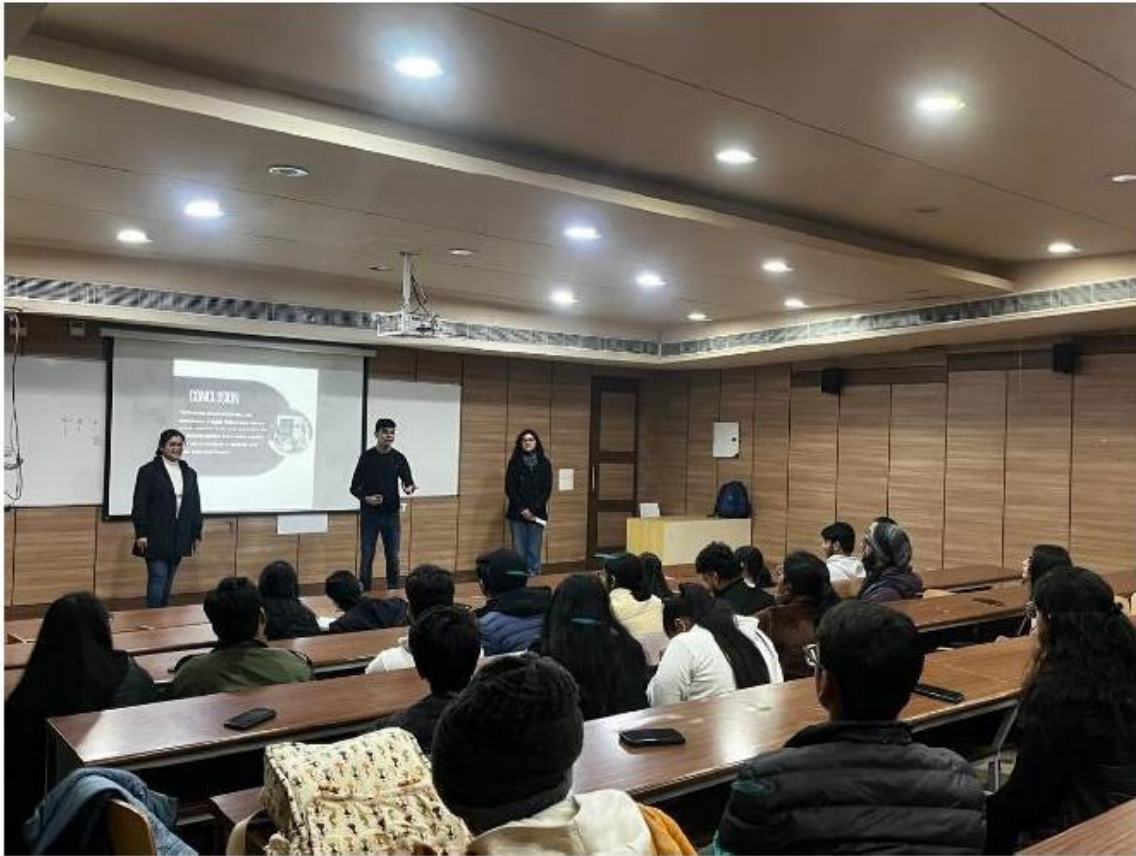
MHSAs concluding the session with a hearty discussion with the participants