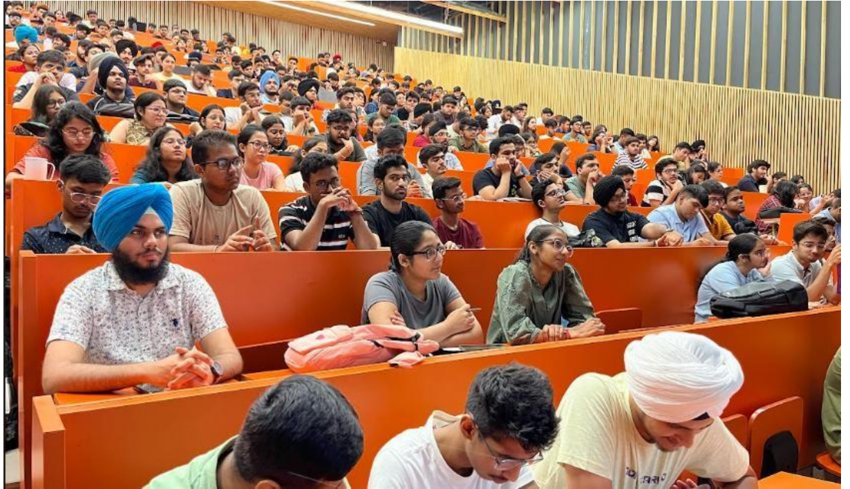
A glimpse of bootcamp session conducted for first year students