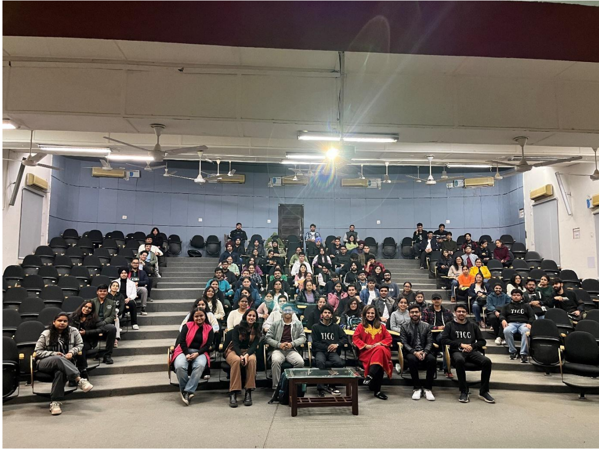
Attendees of the Let's Talk session