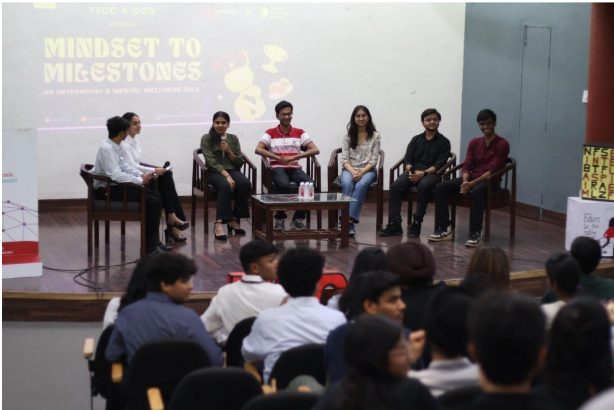
The panelists answering the questions being asked by the moderators