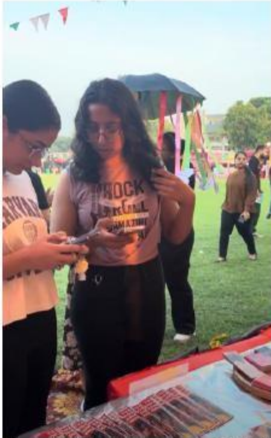
First-year students interacting at the TICC stall