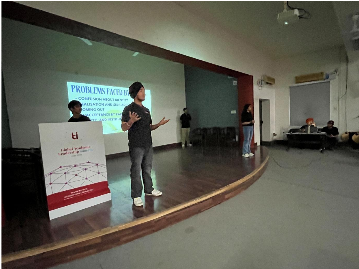
MHSA sharing the Problems which LGBTQ+ community faces in day-to-day life