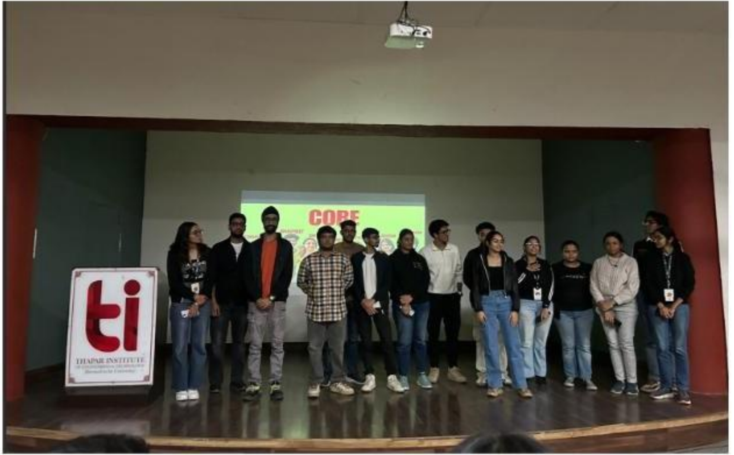
The Core team at TICC