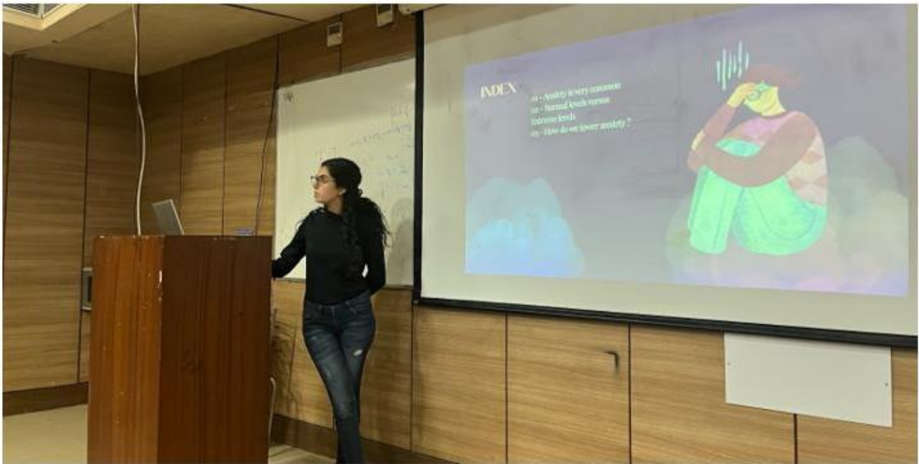
TICC MHSA conducting a Let's Talk session

The media taken during the event is attached below: