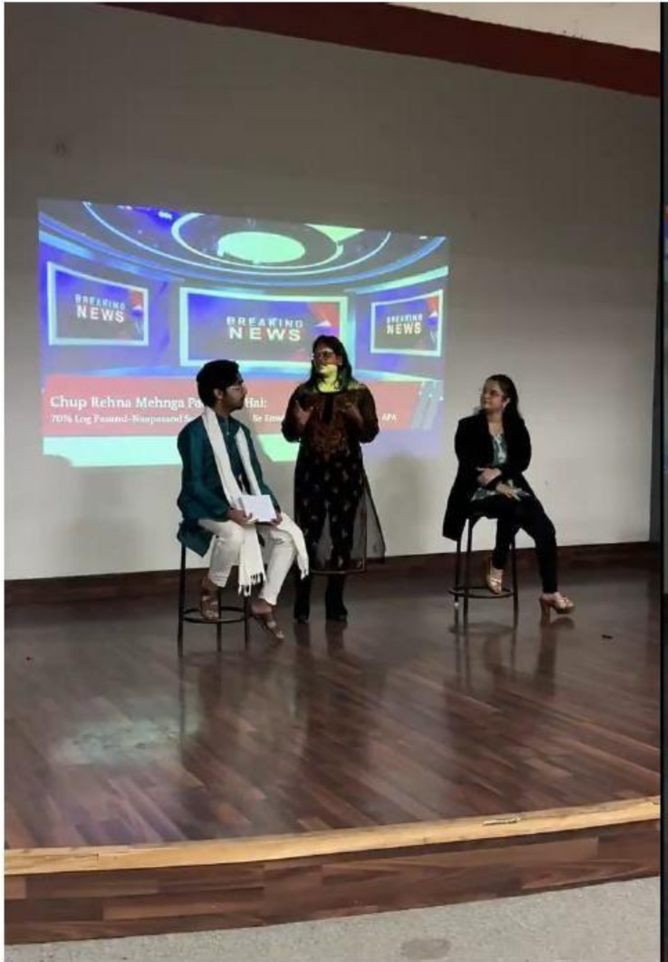
MHSAs are discussing the impacts of losing yourself on mental health