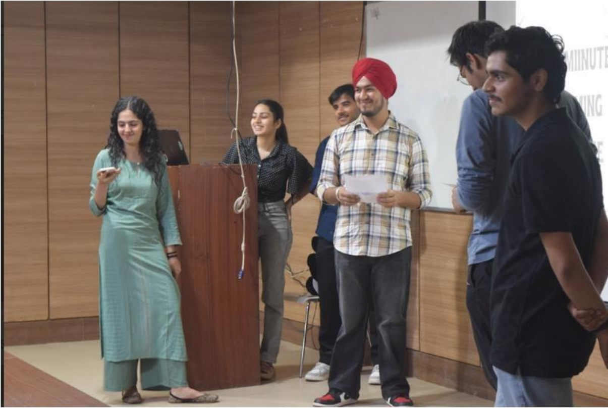
Let's Talk team conducting the session

The media taken during the event is attached below: