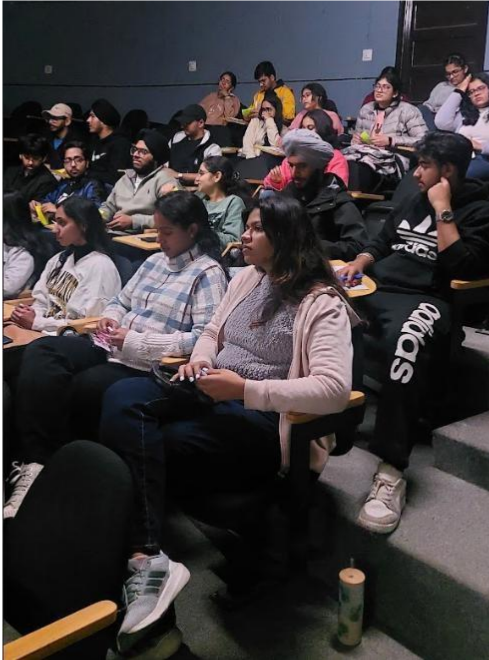
Participants actively listening to Presentation