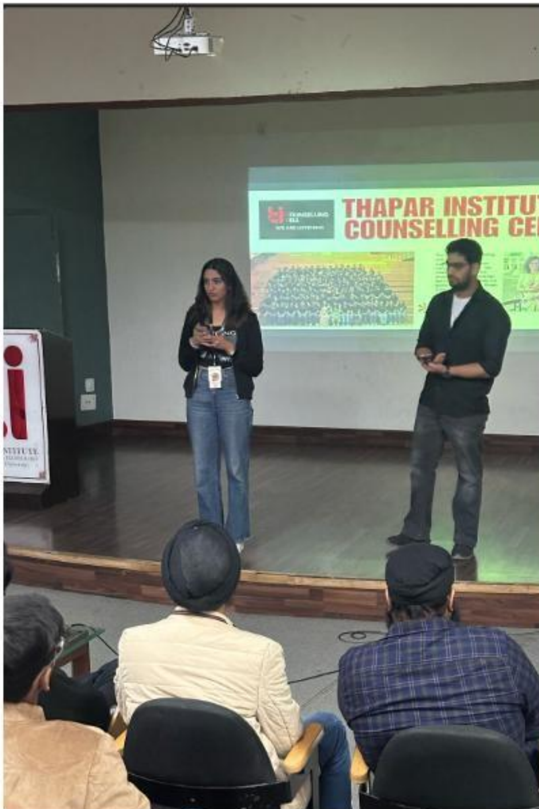
The Induction meet being hosted by TICC Core members

The media taken during the event is attached below: