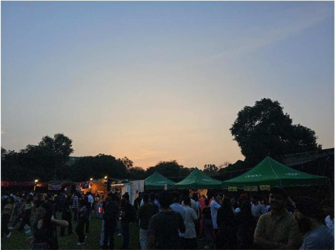
View of Calmefest at dawn