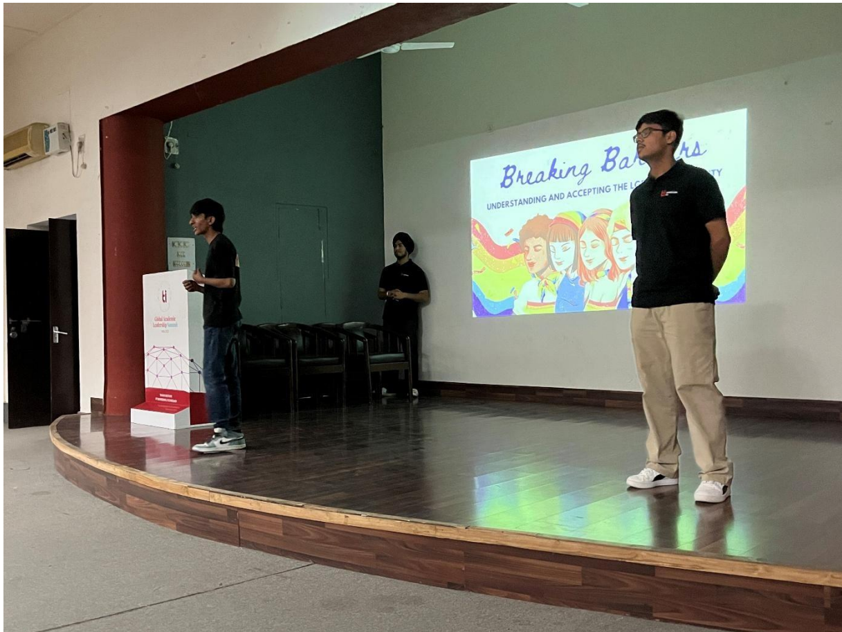
MHSA sharing his personal experiences related to the session

The media taken during the event is attached below: