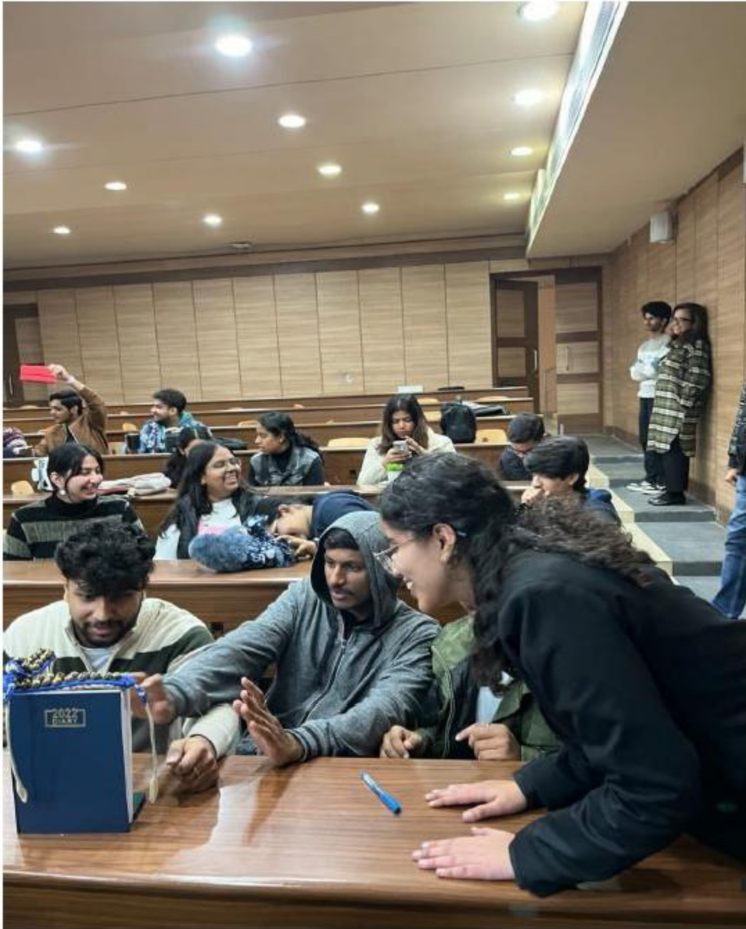
MHSA engages the participants, showing that it's the effort, not perfection that counts