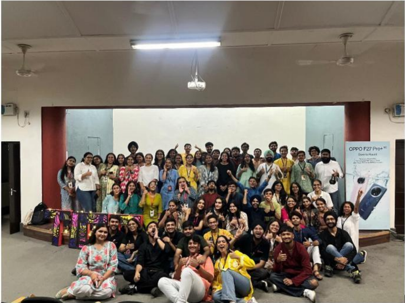
TICC's organizing team for event Khayaal