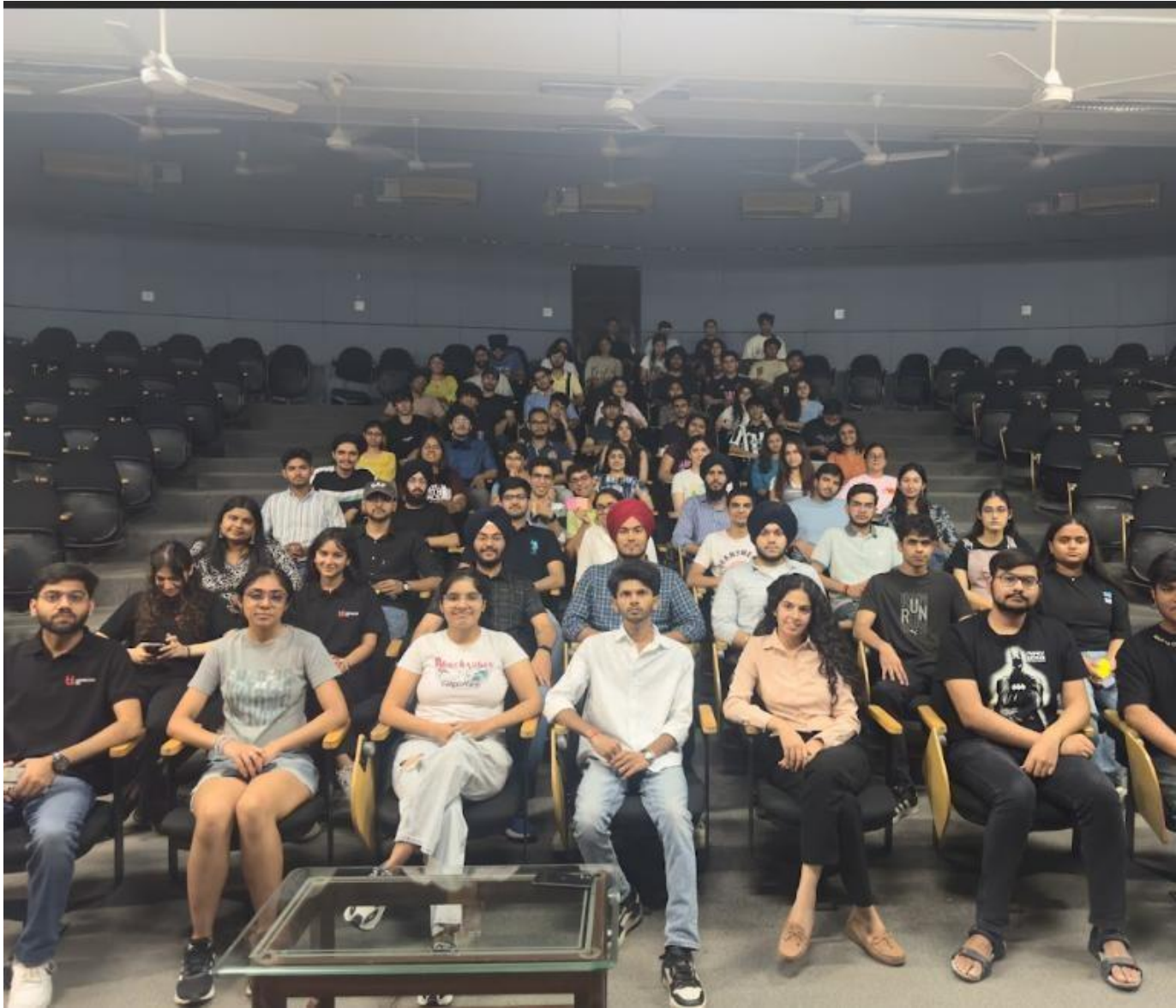
The audience which attended the session