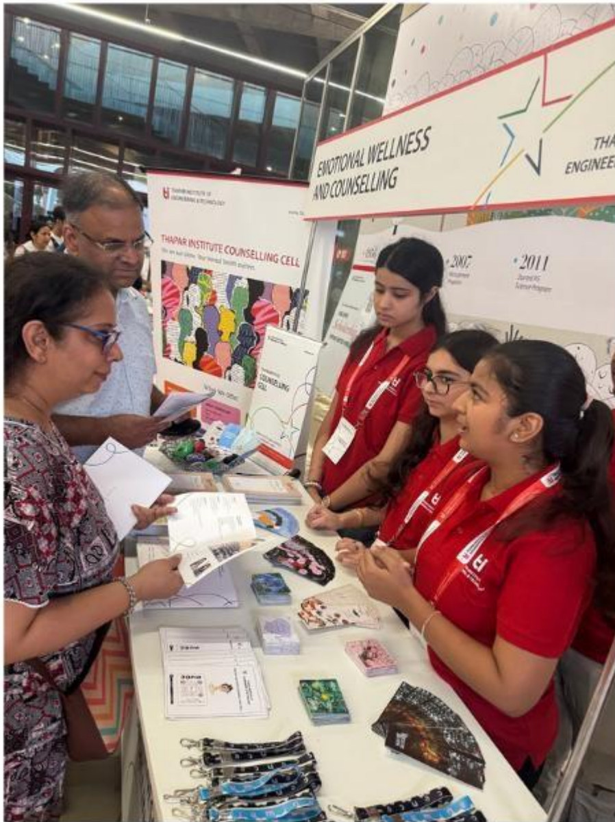
Creating connections that matter — Team TICC in conversation with visiting parents.