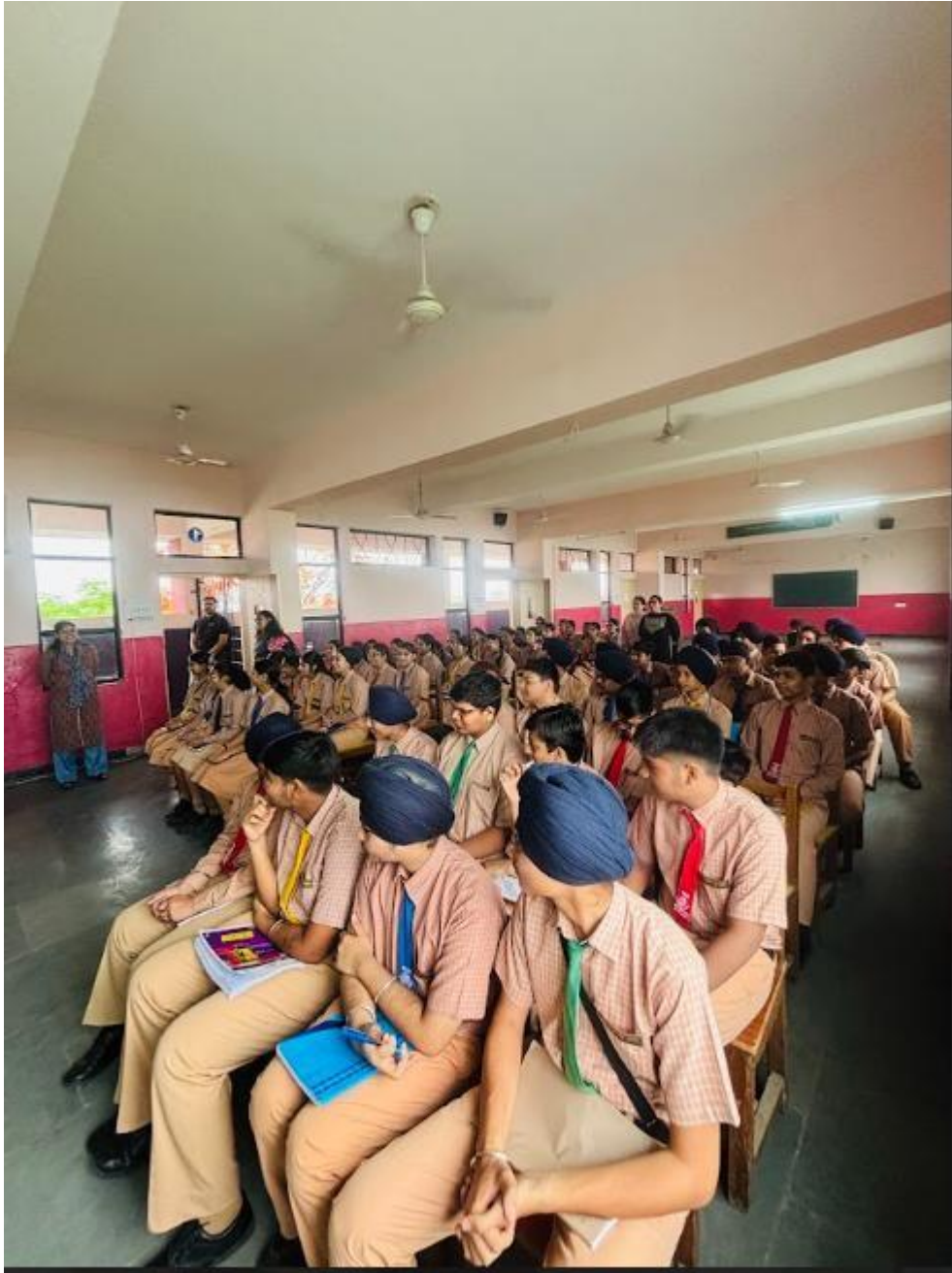
Students at Ryan International school