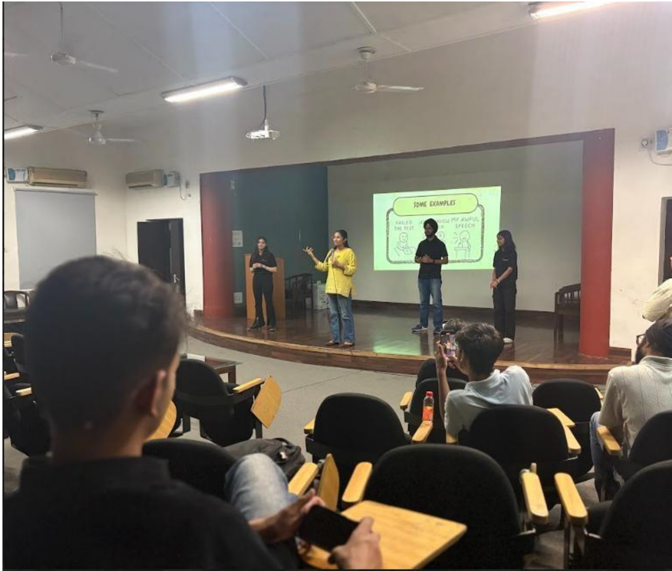
An activity being conducted in the session