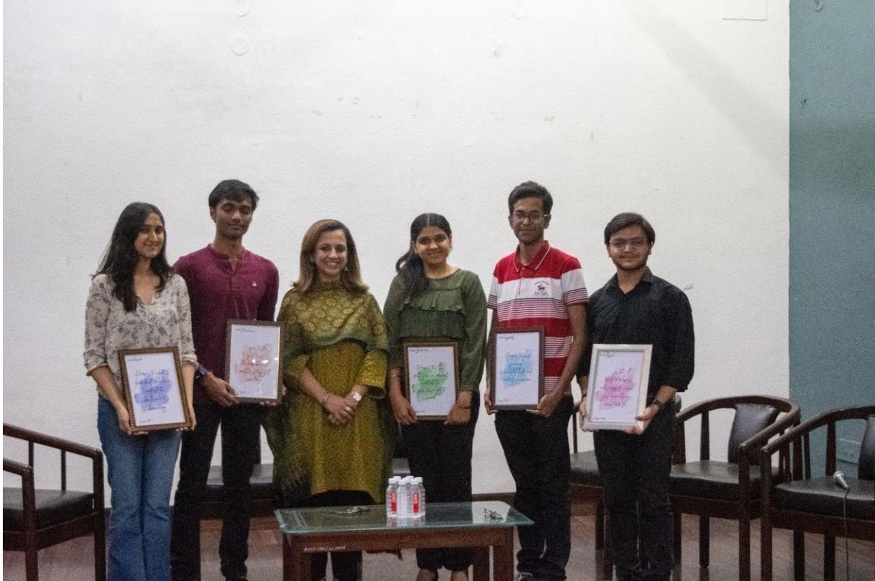
The Panelists received Mementos