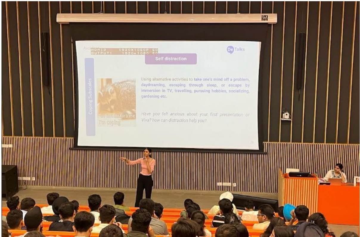
A bootcamp session being taken by a mentor