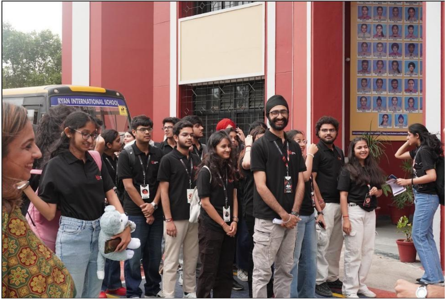
TICC MHSAs at Ryan International School