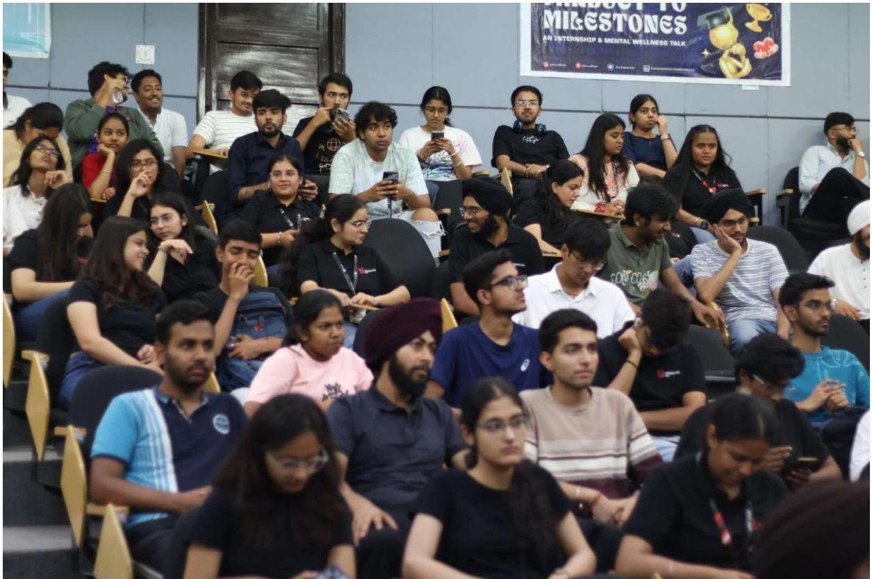
Students enjoying and playing the game

The media taken during the event is attached: