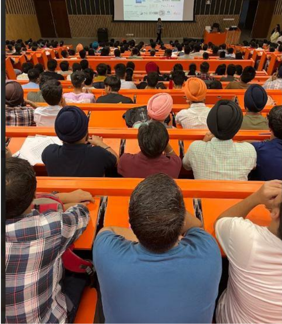
Thapar Students in a bootcamp session

The media taken during the event is attached below: