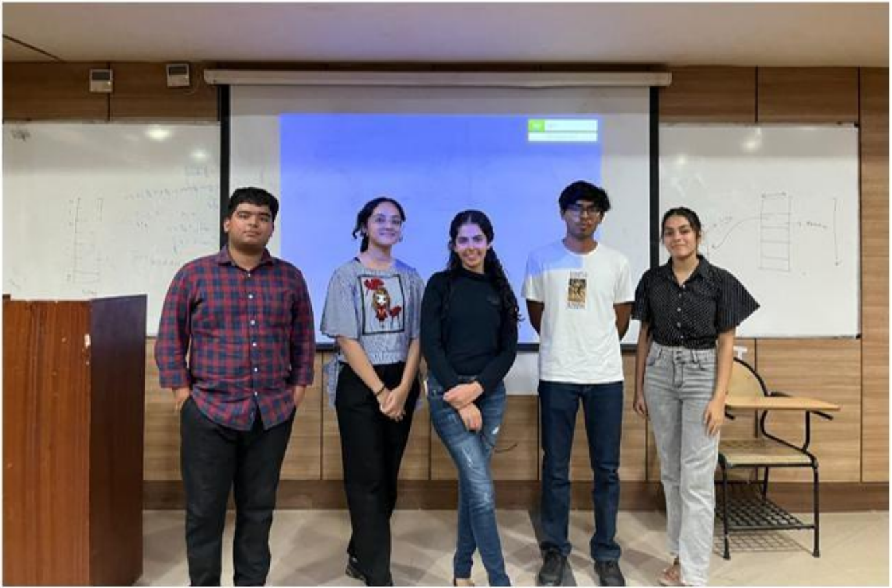
The organising team for the Let's Talk Session