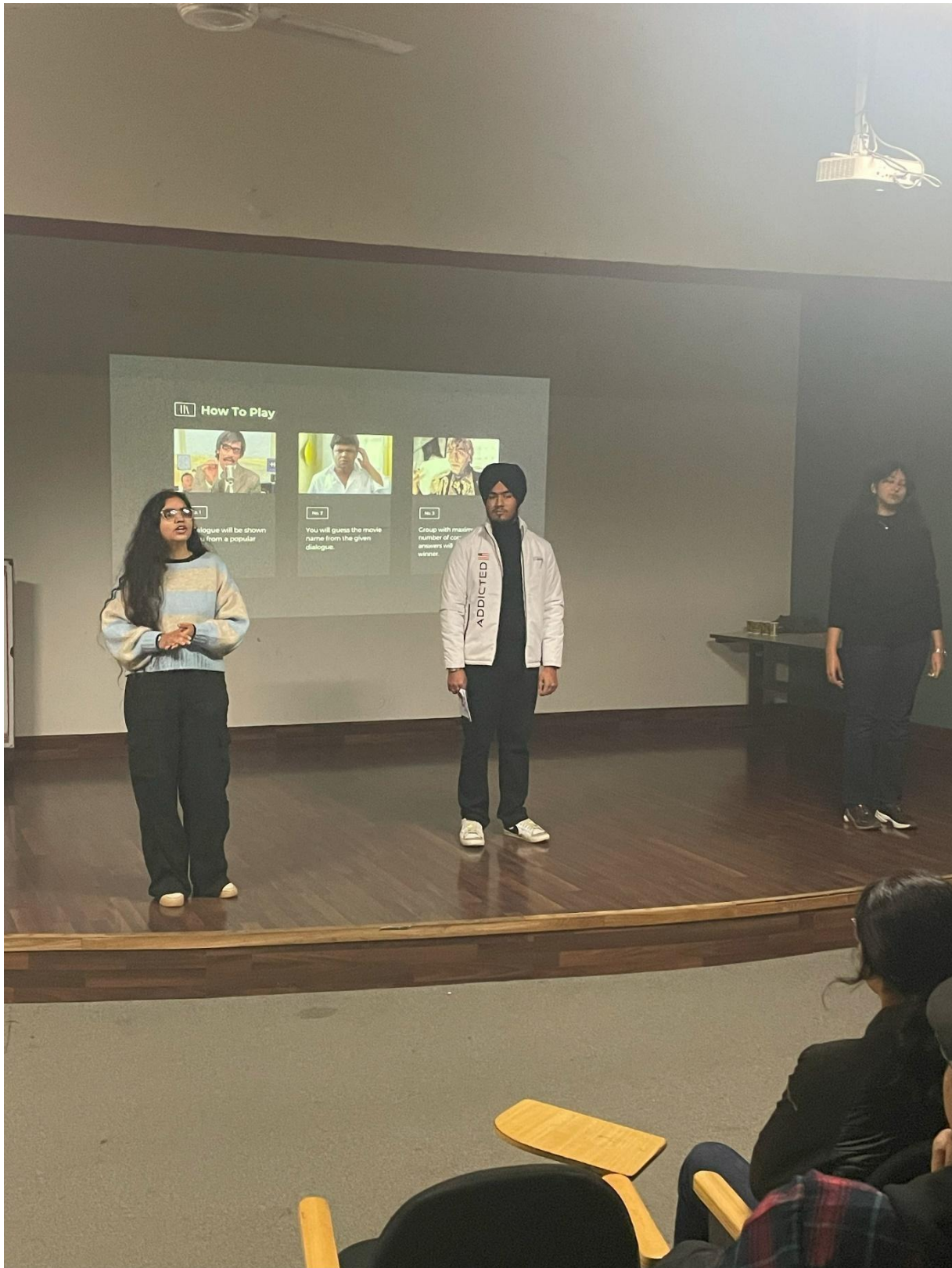
MHSAs hosting Guess the Movie game

The media taken during the event is attached below: