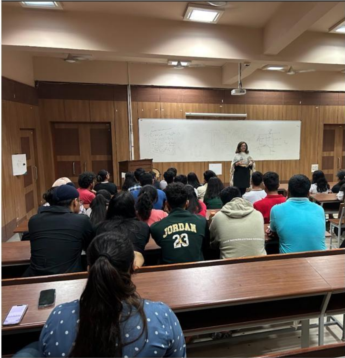
Students attending Let's Talk Session