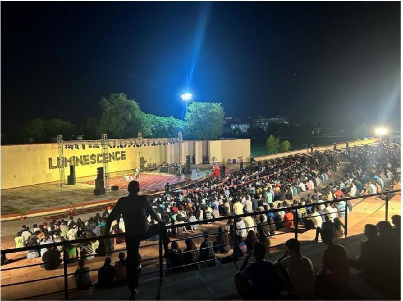
Audience in OAT for Muskurao by Luminescence