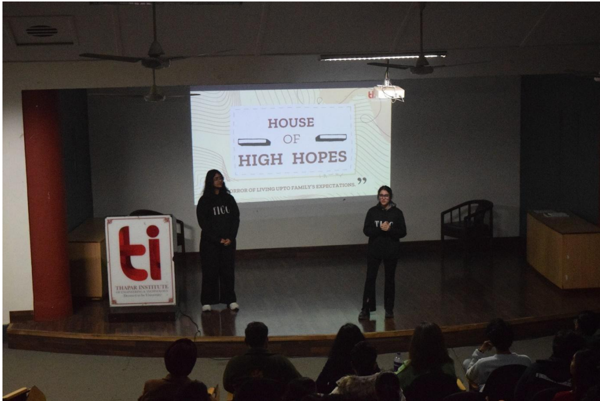
TICC's MHSAs conducting the Let's Talk Session