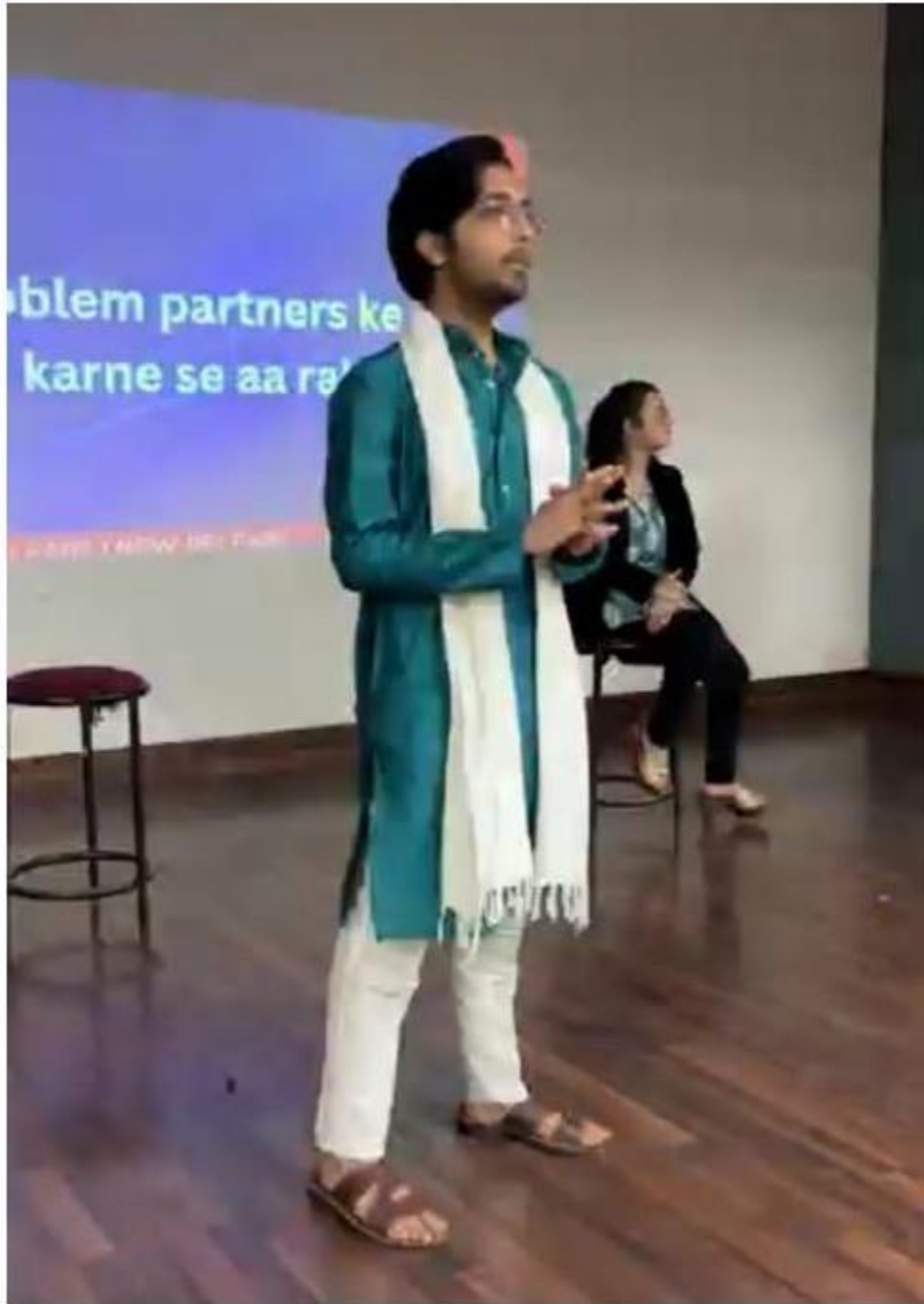
MHSA sharing the reasons why problems arise in the relationship