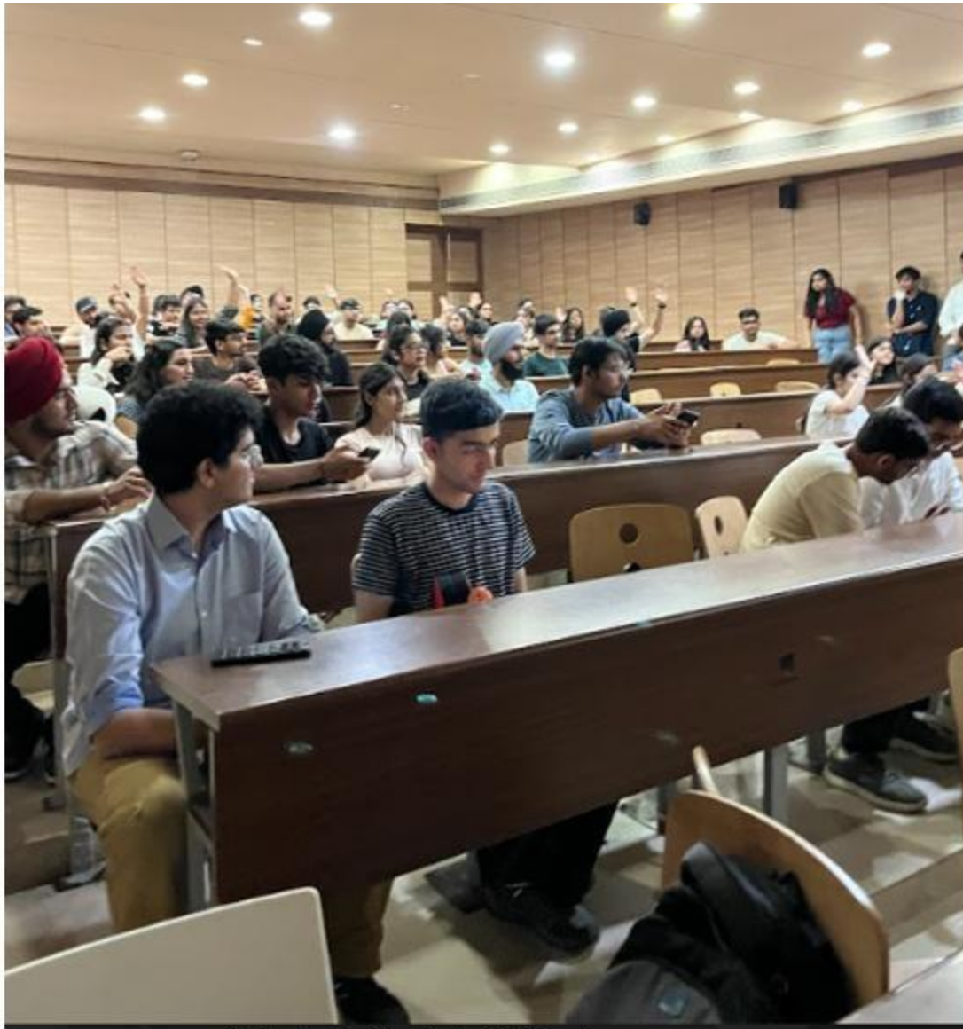
Students attending Let's Talk Session