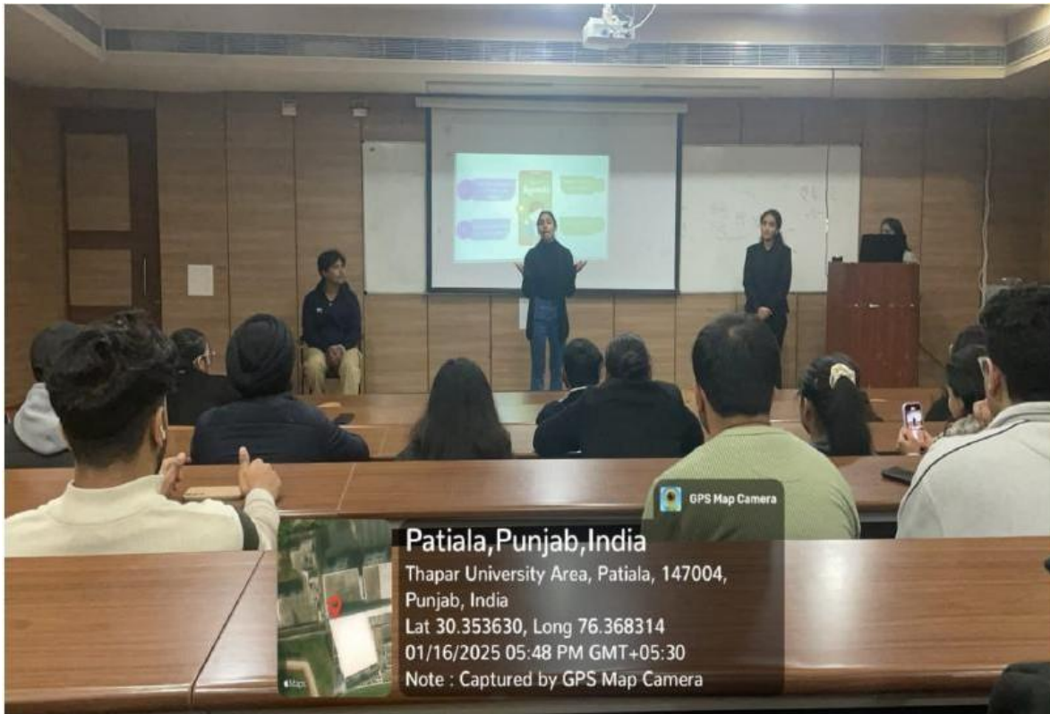
MHSA sharing her personal experiences

The media taken during the event is attached below: