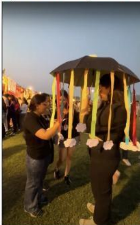
First-year students playing an interactive game at TICC's stall