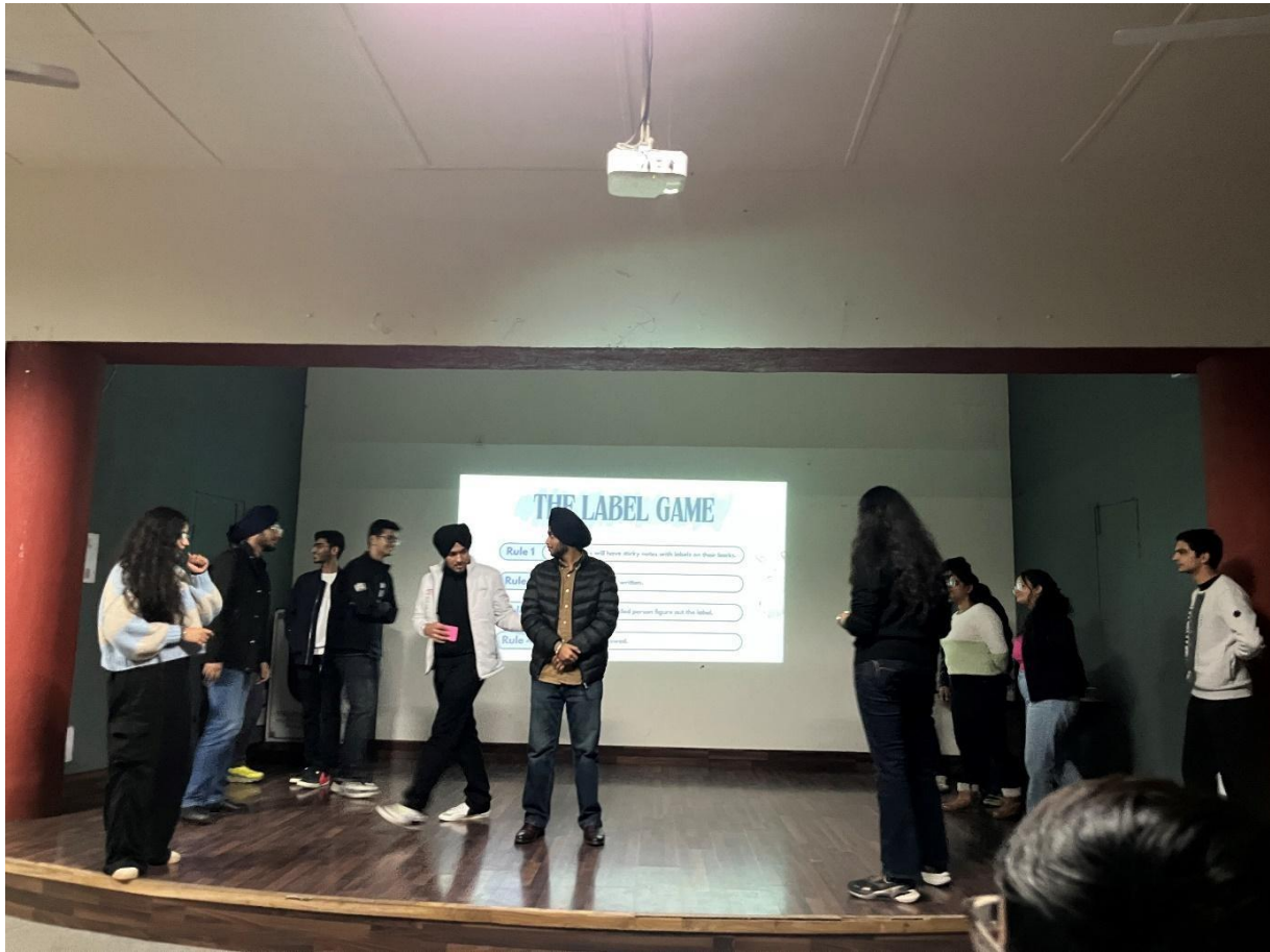
Audience playing the Label Game with MHSAs