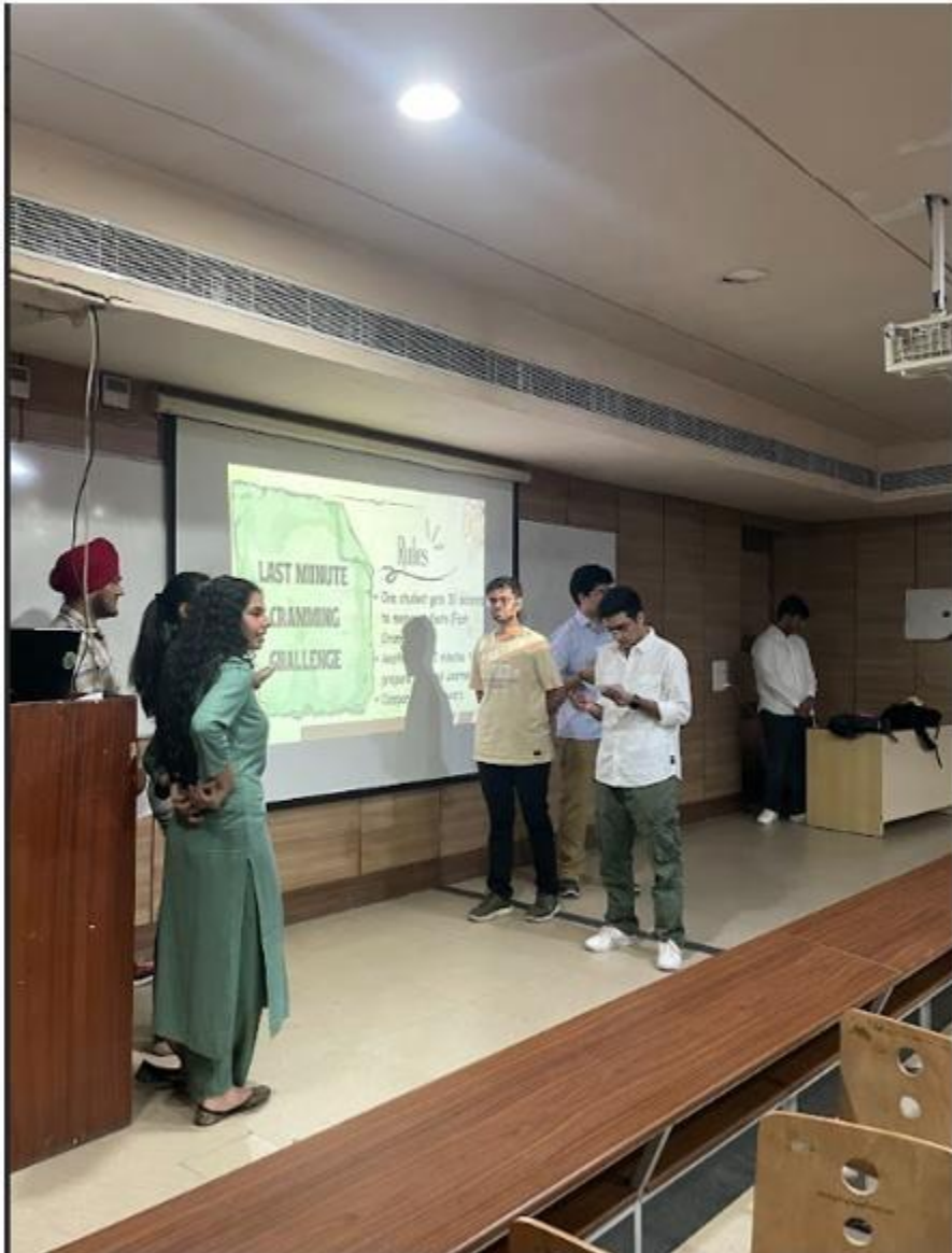
Participants engaging in an activity